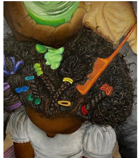
Single Father - 2nd PLACE

Following the decision of a panel of judges, the over-all winner of our district competition is displayed for one year in the Capitol entrance alongside winning artwork from all U.S. districts and territories.