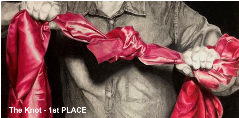
The Knot - 1st PLACE